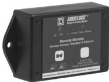
Remote Monitor TVS12RMU