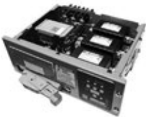
MCC SPD Unit