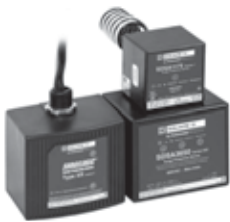
Nipple Mounted SPDs