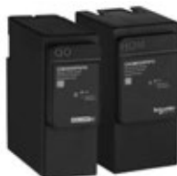
Plug on Neutral QO/CHOM SPDs