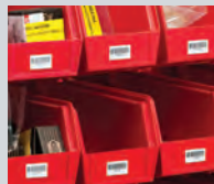
General ID ...and many more!