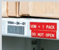
Facility & Safety Identification