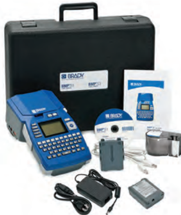
(Catalog #BMP51 shown)

Patents applied for: 6,732,619 and 7,070,347 on printer. 6,929,415 on the PermaSleeve® cartridges. 8,542,155 on wireless and ethernet cards.