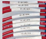
PermaSleeve® Wire Marking Sleeves