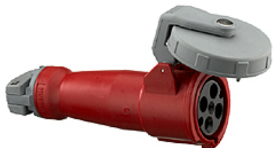
Watertight IEC Pin and Sleeve Connector, 3P4W, 60A 3PH 250V