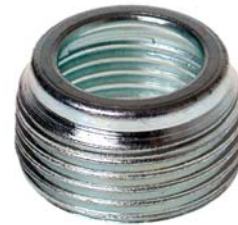
Reducing Bushings Steel