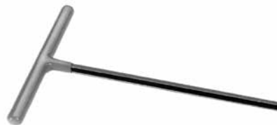
Figure 14. T-Wrench.

The T-wrench is used to install an LRTP into a connector. It is a T-handled, 5/16" hex wrench.