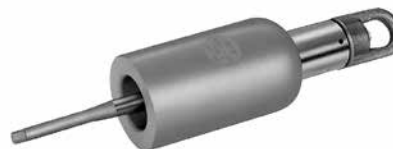
Figure 13. Operating and test/torque tool.

This tool combines the benefits of the O & T and torque tools into one convenient clampstick-operable tool. Used with LRTP-equipped connectors, the EPDM cap latches to the 200 A interface for clampstick operation. The integral torque limiter allows the operator to properly torque connectors without changing tools.