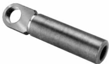
Figure 5. Compression connector.

Compression connectors are available in all aluminum or friction welded coppertop designs, aluminum with unthreaded holes and coppertop with either threaded or unthreaded holes. See Tables 3 and 4 for proper application. All connectors have aluminum crimp barrels and are designed for use with either aluminum or copper conductors.