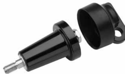
Figure 2. Insulating plug with EPDM rubber cap.

Semiconducting EPDM rubber cap fits over the test point for a waterproof seal and deadfront shielding.