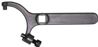
Figure 10. Spanner wrench.

The spanner wrench is required to assemble or disassemble 600 A, 15 kV and 25 kV Class epoxy connecting plugs and deadbreak reducing tap plugs from T-bodies and other apparatus.