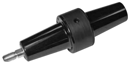
Figure 4. Connecting plug (epoxy) shown with stud.