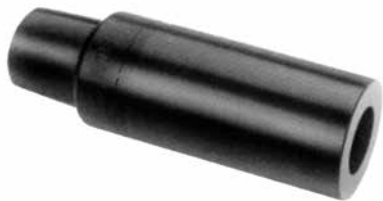
Figure 7. Cable adapter

Molded cable adapter is available in sizes to fit cables from .610" to 1.970" in diameter (15.5 to 50.0 mm). It is molded of high quality peroxide cured insulation and semiconductive rubber to provide stress relief for terminated cable.