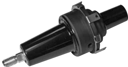
Figure 9. 200 A 15/25 kV deadbreak reducing tap plug.