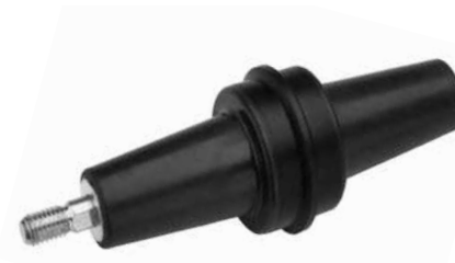
Figure 3. Connecting plug (EPDM rubber) shown with stud.

The versatile design can be used for connecting two or more 600 A deadbreak connectors or, with a bushing extender, to ease cable training by increasing the distance between an apparatus front plate and 600 A connector.