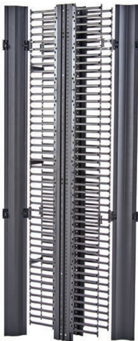
Double sided, 84" high x 6" wide SB86086D084FB

U.S. Patent 7,362,941 Other Patents Pending