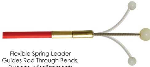
Flexible Spring Leader Guides Rod Through Bends, Sweeps, Misalignments

Round, flexible rod slides easily over wires in occupied conduit. Exceptional bending strength for maneuvering tight turns. Non-conductive and will not kink.