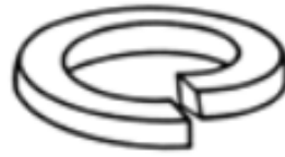
Spring Lock Washers