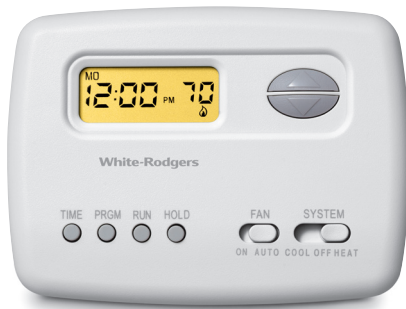
1F78-151 5+2 Day Programmable

Electronic temperature accuracy Adjustable room temperature calibration