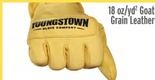
18 oz/yd 2 Goat Grain Leather