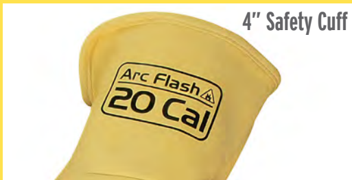
4" Safety Cuff