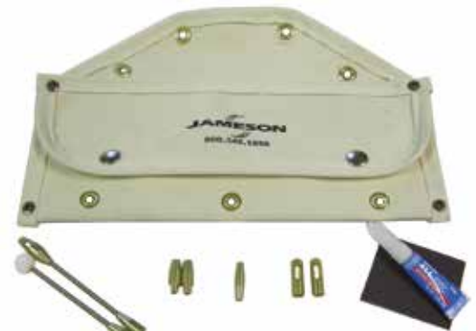
Accessory Kit Attaches To Canister's Frame For Easy Access