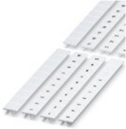
Zack marker strip, 10-section, vertically labeled with the consecutive numbers: 31 ... 40, white, for terminal block width: 10.2 mm

Please be informed that the data shown in this PDF Document is generated from our Online Catalog. Please find the complete data in the user's documentation. Our General Terms of Use for Downloads are valid ( http://phoenixcontact.com/download )