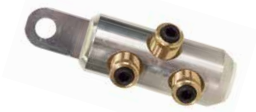
Figure 5. Shear bolt connector.

Bolted cable lug is fitted with stepless bolts, which shear off when optimum contact force has been reached. Provides electrical continuity for copper and aluminum conductors while eliminating need for dies and compression tools. Available in unthreaded aluminum for Eaton's Cooper Power series BOL-T™ and BT-TAP™ connector applications only. See Table 5.