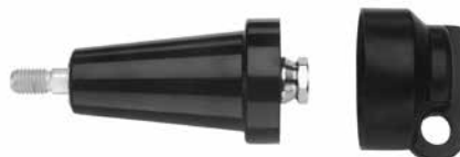
Figure 2. Insulating Plug with EPDM rubber cap.

Insulating Plug, available at 200 kV BIL