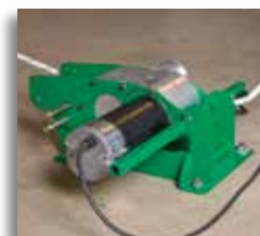
Optional floor mount