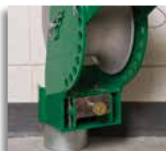
Connect at floor height