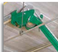
Optional 12' boom extension for high pulls