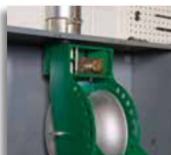
Connect for an downward pull