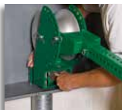
Connect for an upward pull