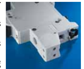
Auxiliary contact integrated to miniature circuit breakers

The new terminal guarantees a very high tightening torque for cables with a section up to 25 mm 2 . The housing of connection busbars in the rear seat guarantees easier wiring. And the new design, without shoulders and standardized for the whole range, offers