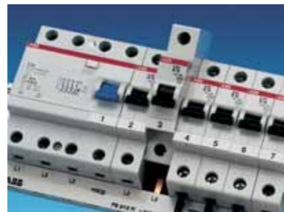
Easy removal without screwdriver.

A number of small but important details allows further time saving. New type and product code marked in front of the device for easier and quicker identifica-