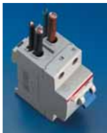
Seats for cables with different cross sections.

errors eliminates right from the start accidents deriving from incorrect wiring.