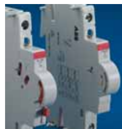
Safe connection by unlosable coupling elements, pins and clamps.

se system they are the only RCCBs on the market that can be removed without the screwdriver.