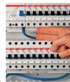
More working space between component rows.

errors eliminates right from the start accidents deriving from incorrect wiring.