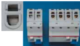
New technology of terminals for protection against misconnection.

The new range offers enormous advantages in relation to installation. Advanced and smart solutions allow a far easier and safer installation and guarantee time saving. One of the most important innovative solutions is the new bi-directional cylinder-lift terminal that allows easier and quicker connections. In addition it avoids errors because it prevents the use of free cable seats. This high protection level against