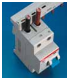
Supply from top or bottom either with cables or busbars.