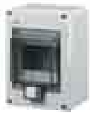
QES 4/3 N