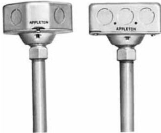
Ball Type Swivel Fixture Hanger Covers shown with octagonal and with square stamped steel outlet boxes.