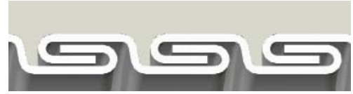
Interlocked Design 1-1/2" through 4" with no bonding wire