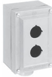
Rosite Glass Polyester Cat. No. 800H-2HZ4R