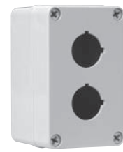
Thermoplastic Polyester Cat. No. 800H-2HZ4C