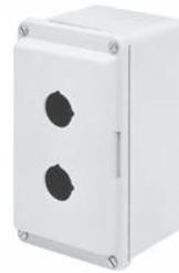
Fiberglass Cat. No. 800H-2HZ4Y