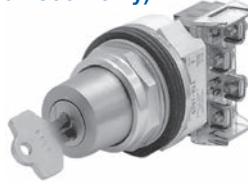
2-Position Cylinder Lock Operator Cat. No. 800T-H33A