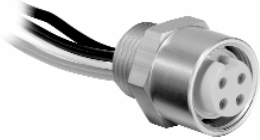
4-pin Female Receptacles