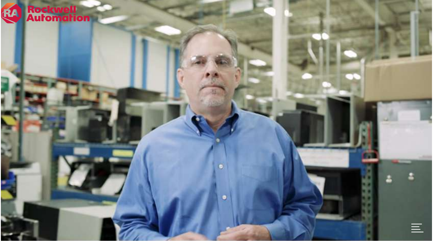
Video: Optimizing Remanufacturing Services