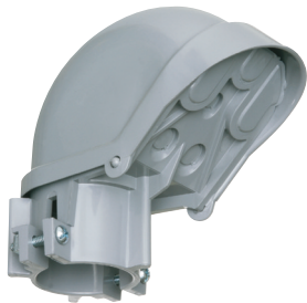
PVC105, PVC106, & PVC129