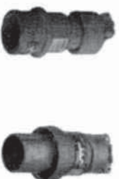
Plugs and Receptacles