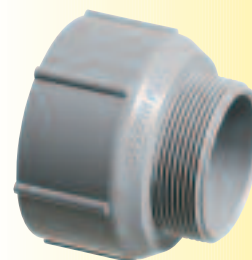
NM2520 Patents pending

Easy to install, NM2520 is designed to create an expansion joint in the installation of an electrical service entrance.