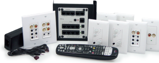
AU1021-XX lyriQ Multi-Source, 4-Zone Kit with Flush Mount Inputs