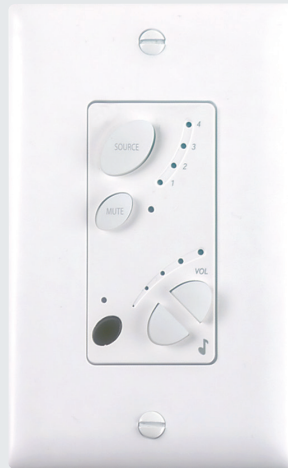
LyriQ Keypad (AU7394-XX)

Built on Cat 5 cabling, the LyriQ Audio System includes easy installation features such as convenient RJ45 connections.