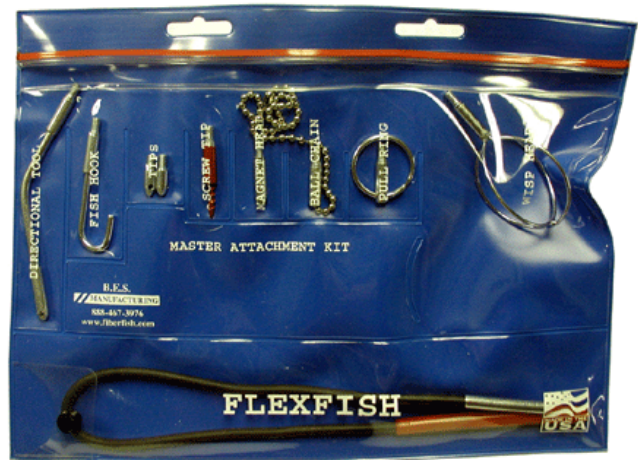
Master Attachment Kit