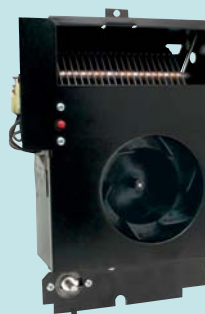
HEATER ASSEMBLY WITH THERMOSTAT