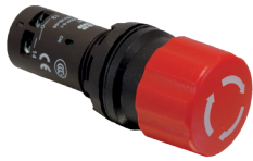
Emergency Stop Pushbutton twist release, 30 mm