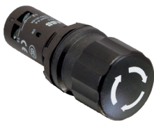
Machine Stop Pushbutton twist release 30 mm