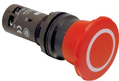
Emergency Stop Pushbutton pull release, 40 mm