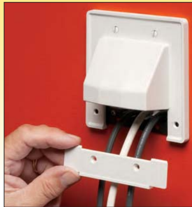
CER2 with Scoop facing OUT & lower plate removed.