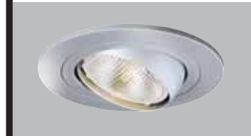
996SL Silver Trim with Silver Trim Ring