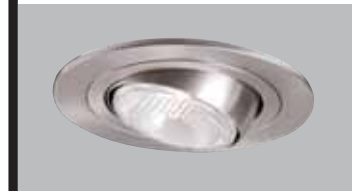
996SN Satin Nickel Trim with Satin Nickel Trim Ring