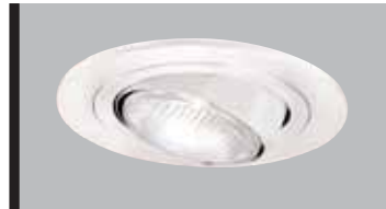
996P White Trim with White Trim Ring