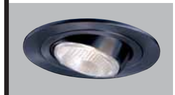
996TBZ Tuscan Bronze Trim with Tuscan Bronze Trim Ring