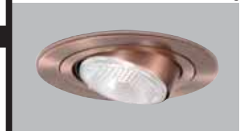
996AC Antique Copper Trim with Antique Copper Trim Ring