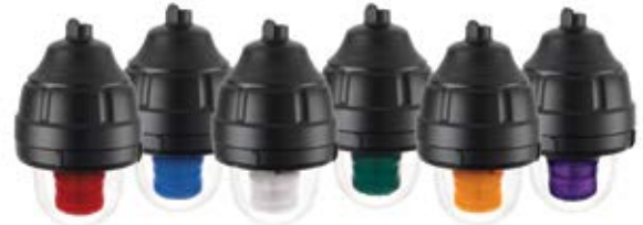
(Shown with pendant mount. See how to order for mounting options)