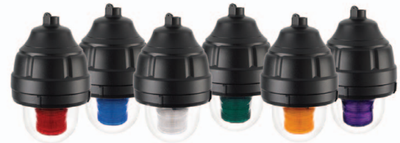
(Shown with pendant mount. See how to order for mounting options)