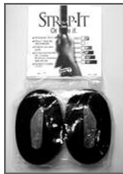
2 pc Hang-up Display