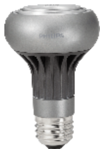
EnduraLED E26 R20