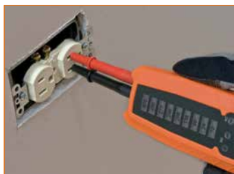
Measure Tamper-Resistant Outlets