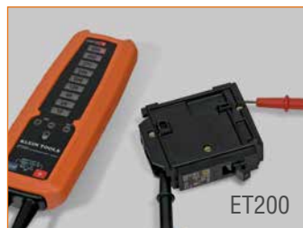
Check Circuit Breaker Continuity