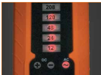
Bright Red LEDs Indicate Voltage