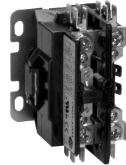
25A-35A 1 pole + shunt