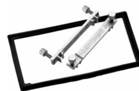
Remote Mounting Kit