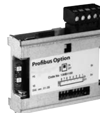
Profibus DP Communications Module