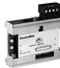
DeviceNet Communications Module