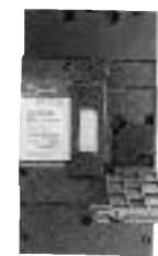
Right Side Pouch