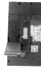
Left Side Pouch

All accessory contacts shown with the circuit breaker in tripped position.