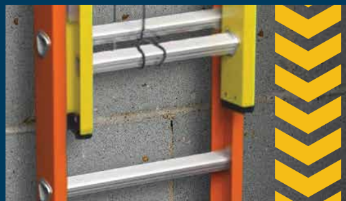
Lowering assist controls descent