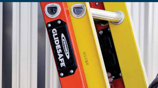
Lift assist technology reduces strain