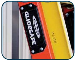
Lift & lowering assist technology