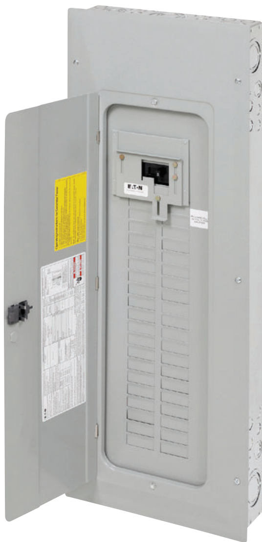
Type BR Loadcenter with Mechanical Interlock Kit

With the aging electrical infrastructure and frequent severe storms, power outages are becoming more and more frequent affecting thousands of people nationwide. Eaton's Mechanical Interlock kit provides an easy and cost effective solution when using back-up emergency power.