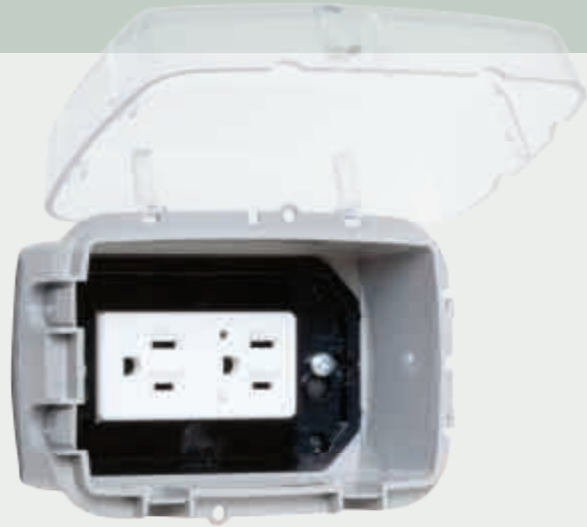
GFCI DEVICE SHOWN NOT INCLUDED