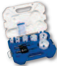
9 Piece, Electrician's Kit Product No. 30295-600CTL 7/8", 1-1/8", 1-3/8", 1-3/4", 2", 2-1/2" Arbors: 1L, 2L. One 123CT pilot drill.