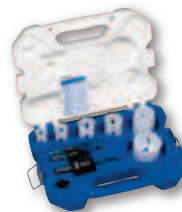
11 Piece, General Purpose Kit Product No. 29985-700CGK 7/8", 1", 1-1/4", 1-3/8", 1-1/2", 1-3/4", 2-1/8" Arbors: 1L, 2L. One 123CT pilot drill. One arbor adaptor.