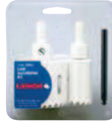
Door Lock Installation Kit Product No. 34085-200ALI 1", 2-1/8" Clamshell pack.