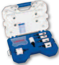
6 Piece, Plumber's Kit Product No. 34082-600AP 3/4", 7/8", 1-1/8", 1-1/2", 1-3/4", 2-1/4"