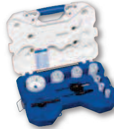
15 Piece, General Purpose Kit Product No. 30290-1100CTG 3/4", 7/8", 1", 1-1/8", 1-1/4", 1-3/8", 1-1/2", 1-3/4", 2", 2-9/16", 3" Arbors: 1L, 2L. Two 123CT pilot drills.