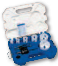
10 Piece, Plumber's Kit Product No. 29984-600CGP 3/4", 7/8", 1-1/8", 1-1/2", 2-1/8", 2-9/16" Arbors: 1L, 2L. One 123CT pilot drill. One arbor adaptor.