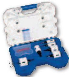
6 Piece, Electrician's Kit Product No. 34081-600AE 7/8", 1-1/8", 1-3/8", 1-3/4", 2", 2-1/2"