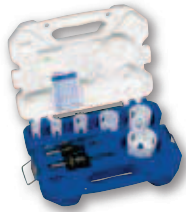
9 Piece, Plumber's Kit Product No. 30294-600CTP 3/4", 7/8", 1-1/8", 1-1/2", 1-3/4", 2-1/4" Arbors: 1L, 2L. One 123CT pilot drill.