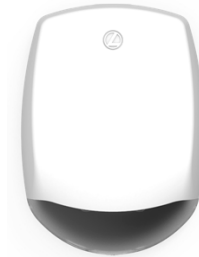
without photocell (white)