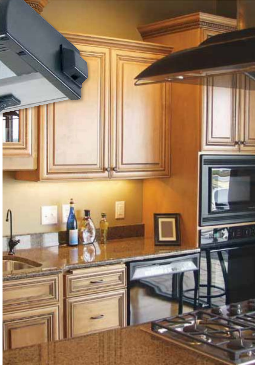
Patented baffle increases the velocity of the cooling air.