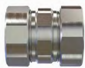
Compression Nuts have a Full Flat Hex Surface

Twice the Strength and Durability with a Fraction of the Weight and Size of Malleable Iron