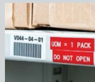
Facility & Safety Identification