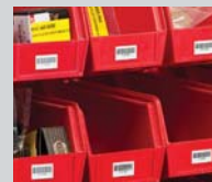
General ID ...and many more!