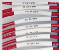
PermaSleeve® Wire Marking Sleeves