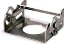
Emergency Stop Cover IEC 22.5mm (PBL4)