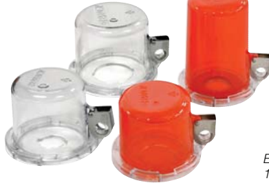
Each base supplied with 1 yellow label, 1 red label and adhesive backing.