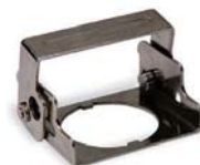
Emergency Stop Cover NEMA 30.5mm (PBL2)