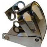
Push Button Cover IEC 22.5mm (PBL8)