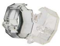
Push Button Cover NEMA 30.5 mm (PBL6)