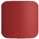
Locking Button Top View