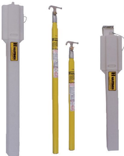
06-186 HV-312 HV-208 06-185