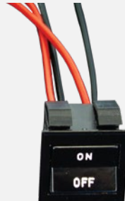
Double Pole Disconnect