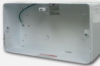
Surface Wall Enclosure